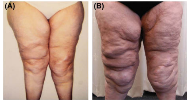
Figure 7. (A and B) Lipedema Progression over 13 years without treatment.

suction techniques using general anesthesia. Liposuction techniques using radio frequency, ultrasound, or laser are not useful for lipedema patients because of possible damage to lymphatic vessels.