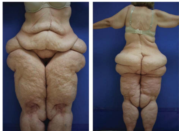
Figure 1. (Front and back): A 50-year-old woman exhibits the typical clinical features of Stage III lipedema or “two-body syndrome”. The area above the waist is normal except for excess subcutaneous fat on the arms. The areas below the waist demonstrate severe deformity.

Diabetes and hypertension are uncommon in lipedema patients. Only one of 51 lipedema patients in Herbst's series had Type 2 diabetes. 3 Three of 500