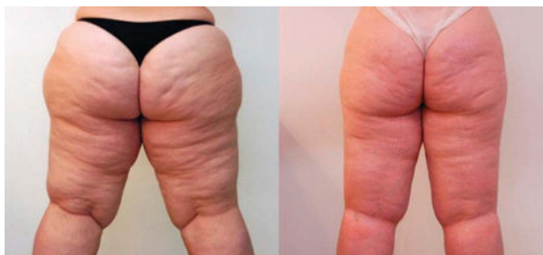
Figure 9. A 34-year-old woman demonstrates typical lipedema with enlargement of the thighs and buttocks. A total of 9.8 L supranatant fat removed during several liposuction procedures.

In 2016, Baumgartner and coworkers 22 reported 8-year follow-up on 85 lipedema patients treated with liposuction using tumescent local anesthesia. The same group of patients had been evaluated 4 years after liposuction. 20 The improvement is spontaneous pain, pressure sensitivity, bruising, edema, and mobility that occurred at 4 years postoperative was sustained at 8 years. Improvement in cosmetic appearance, quality of life, and overall impairment was also sustained at 8 years. Patients experienced a reduced need for conser-