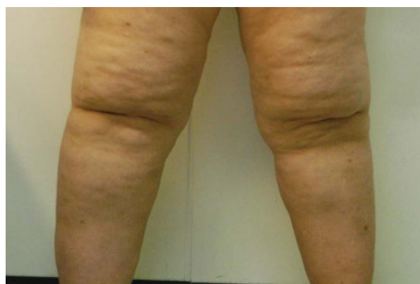
Figure 4. A patient with lipedema demonstrates hooding of the patella and the subpatellar fat pad on the anterior upper leg.

Manual lymphatic drainage (MLD), intermittent pneumatic compression, compression stockings, exercise, and skin care are often used to control pain and symptoms. Recent studies have shown that there is little or no edema in lipedema. 10,11 Therefore, treatment with MLD has no significant therapeutic effect on lipedema except perhaps making the patient feel better because of the “hands-on” nature of MLD. Diet is often used to prevent or treat obesity when it is associated with lipedema. It is