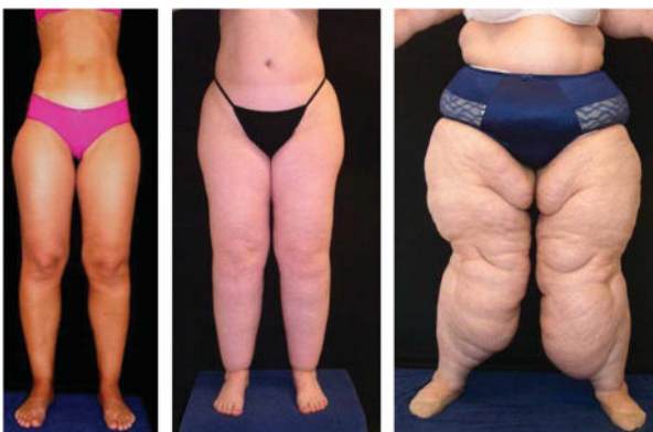
Figure 6. Patients demonstrating lipedema (Stage I, II, III).

Surgical treatment involves delicate, atraumatic lymph-sparing liposuction using tumescent local anesthesia. The treatment has been proven to be safe and effective for cosmetic indications and lipedema. 12–19 Examination of adipose tissue using lymphoscintigraphy and immunohistochemistry has demonstrated no significant damage to lymphatic vessels from liposuction using tumescent local anesthesia compared with traditional lipo-