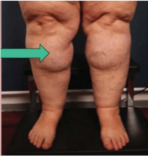
Figure 5. Subpatellar (“bottleneck”) fat pad below the knee is common in lipedema patients.

essential for lipedema patients to avoid weight gain. “yo-yo” dieting and obesity have been shown to exacerbate lipedema. 10,11