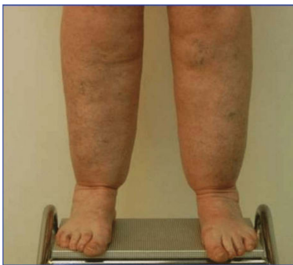
Figure 3. “Cuff sign” above the ankles with sparing of feet is common in lipedema patients.

Without treatment, lipedema will progress through the various stages (Figure 7).